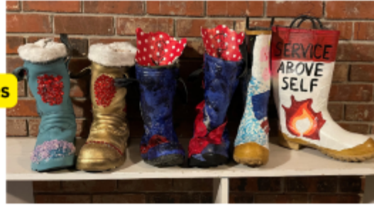
Boots for Heroes

Welcome Welcome Welcome to all who come to the Roswell Rotary meeting this Thursday for lunch. We will not only be hosting 13 of our 16 Interact Clubs but also the City of Roswell Youth Ambassadors for the Youth Day Parade on Saturday, Oct 3rd. This meeting is always inspiring and gives us the very face of hope on our stage.