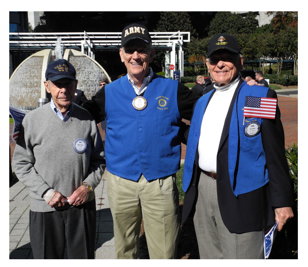
FAMILY OF ROTARY RSVP For 2017 Holiday Party